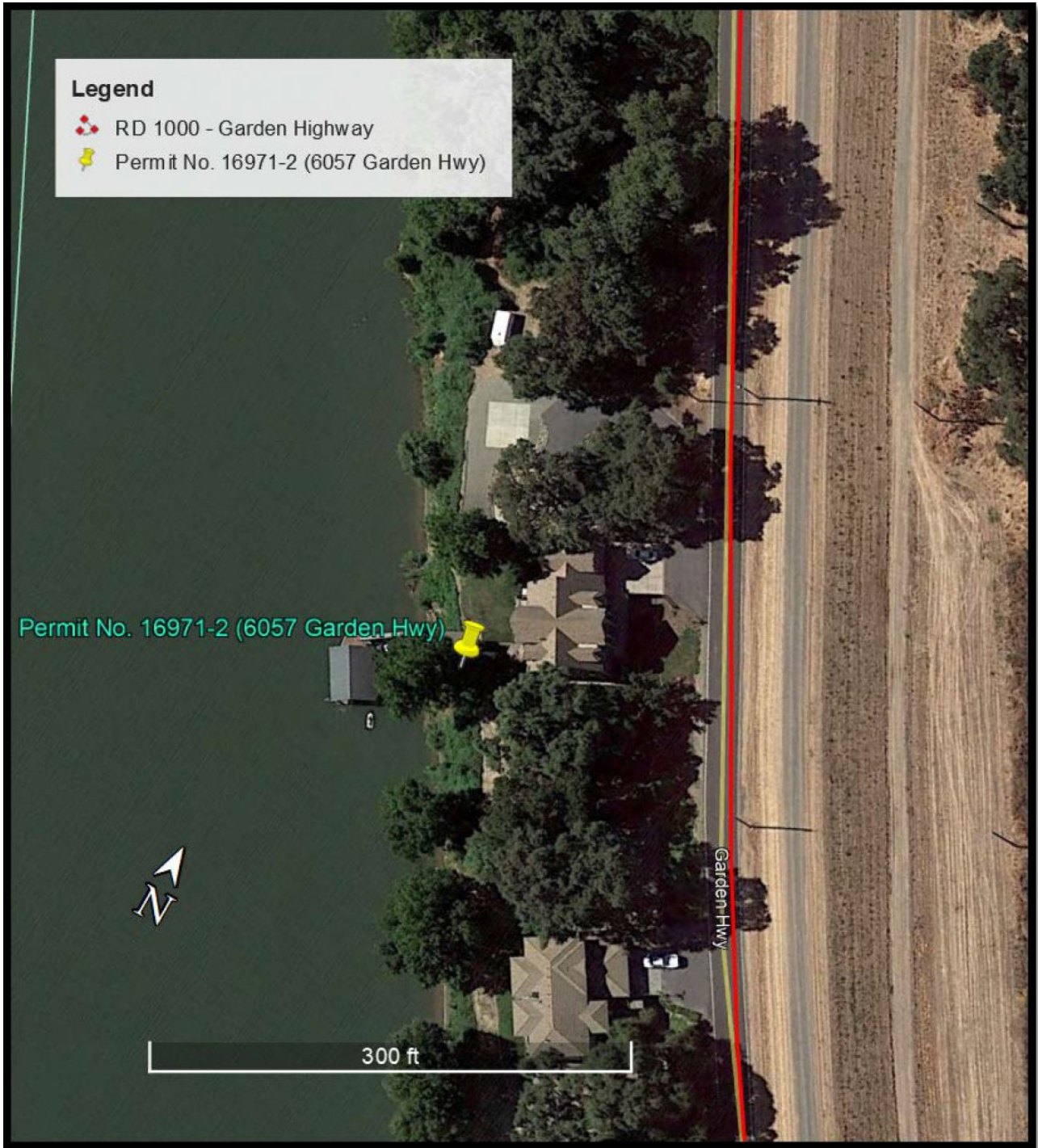
3) Approximate project footprint map